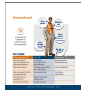
The flipbook features colourful charts and bullet-point-style text.